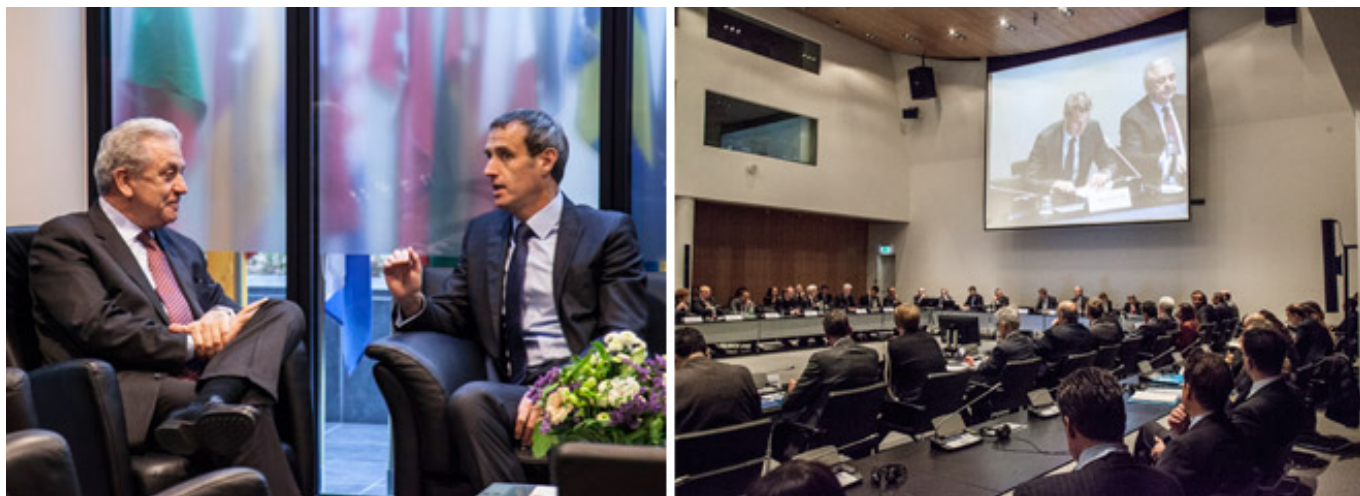
European Commissioner for Migration, Home Affairs and Citizenship, Dimitris Avramopoulos and Rob Wainwright, Director of Europol

This proactive law enforcement response will build on Europol's capabilities, identifying concrete investigative leads and supporting Member States in initiating new investigations. As well as collating and distributing appropriate intelligence, the data on the organised criminal groups will be analysed, from which specialised intelligence reports will be produced.